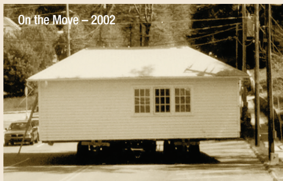
On the Move - 2002