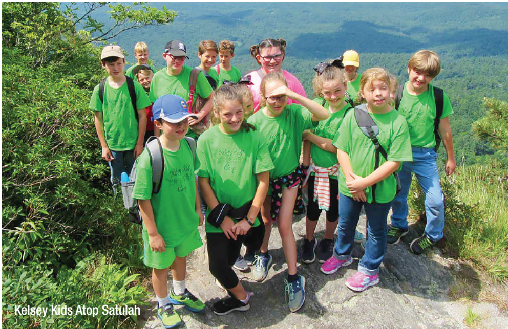
Kelsey Kids Atop Satulah