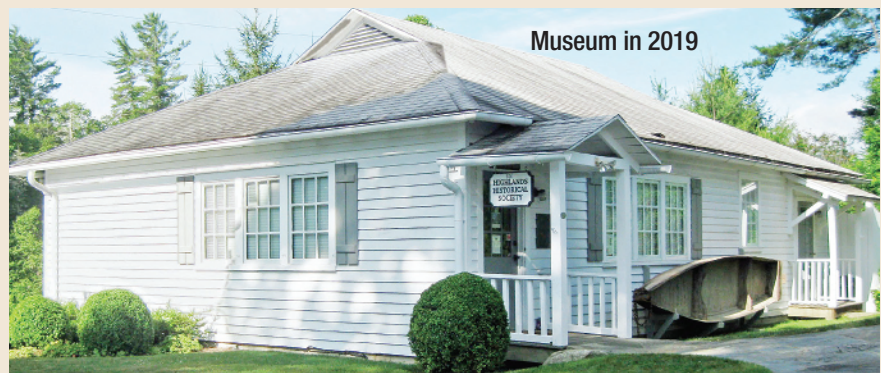
Museum in 2019

Built in 1915 as one of the first libraries in North Carolina, this classic structure served this purpose for 83 years until it was donated to the Highlands Historical Society to become its showcase museum. It was moved to its present site in 2002.