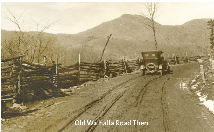
Old Walhalla Road Then